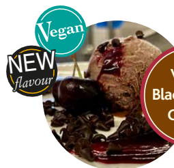
Vegan NEW flavour Vegan Black Forest Gateau

A tropical wonder; sweet yet tart, bold yet subtle, a truly beautiful stand-out Gelato!