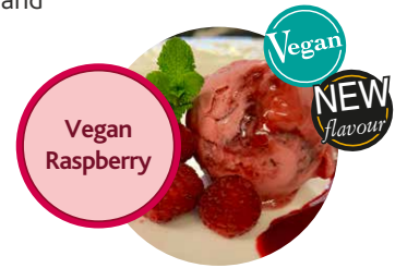
Vegan NEW flavour Vegan Raspberry