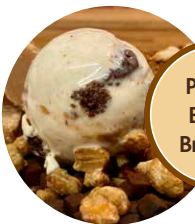
Peanut Butter Brownie

The finest cocoa is carefully melted and whipped into a thick, creamy gelato. Lightly salted to create a dark, rich and luxuriously smooth Belgian chocolate flavour.