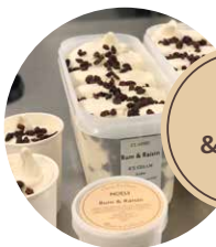
Rum & Raisin

A distinctive, green classic. Bright, refreshing and deservedly loved by the British people!