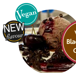
Vegan Black Forest Gateau

A tropical wonder; sweet yet tart, bold yet subtle, a truly beautiful stand-out Gelato!