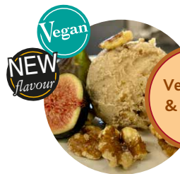
Vegan NEW flavour Vegan Fig & Walnut

What can i say, this just works. A rich vegan chocolate base folded with a bold cherry sauce combining the subtle uplifting notes of liquor and sea salt. It's a Classic for good reason.