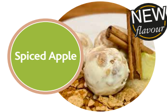
Spiced Apple NEW flavour

A perfect vegan combination. Wholesome, delicate and sophisticated. This flavour creates a wonderfully unique and natural vegan gelato. Definitely worth a try.