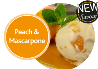
Peach & Mascarpone

A distinctive, mellow, yellow gelato. Gently folding in 30% of one of the world's most loved fruits to create beautiful natural timeless classic.