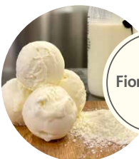
Fior di Latte

Simply delicious! A sweet, salty yet delicate peanut butter gelato. Carefully churned with beautifully chewy chocolate brownie and fudge chunks.