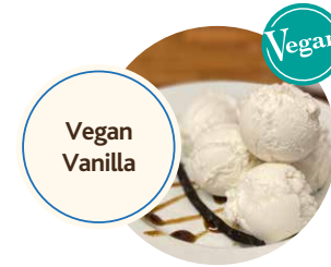
Vegan Vegan Vanilla